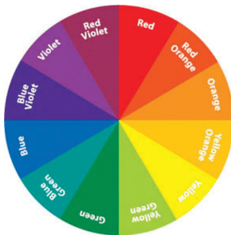
Figure 1: While combining flower colors is a personal choice, there are design principles to keep in mind. Use complementary colors on the opposite side of the color wheel or analogous colors adjacent on the color wheel. Examples of complementary colors are orange and blue or yellow and violet. Analogous color examples are orange and yellow, or blue and violet.

Container gardening can add impact to your garden or outdoor room through the use of color. Hot colors like orange and