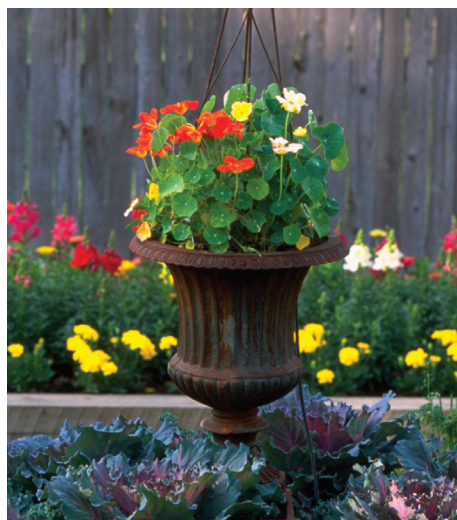
As a general guide, flowering plants, water plants, and fruiting vegetables require a minimum of eight hours of full sun each day to perform well. Root vegetables do best with six hours, and leafy vegetables and many herbs should receive at least four hours of sun. Some foliage plants are best located in filtered light or continuous shade.

A grouping of containers devoted to different colors can help achieve the composition desired. Consider the color of plants within a container and the color among the group of containers. The colors of the containers themselves will contribute to the entire effect.